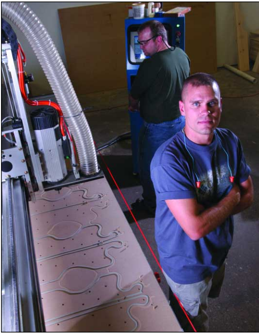
The Wood Line, Inc., West Virginia